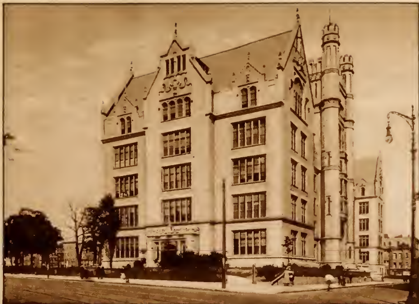
MORRIS HIGH SCHOOL, Boston Road at 166th Street.